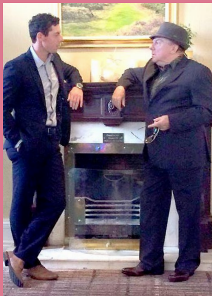
Rory McIlroy and Sir Van Morrison casually talking together in the Drawing Room of the Hotel in 2015