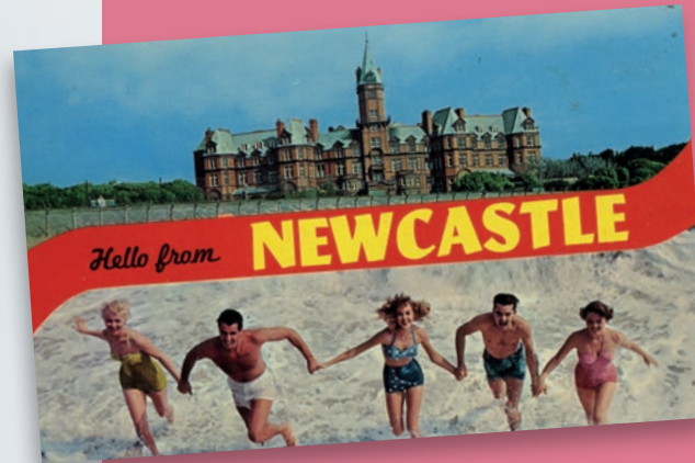
One of many postcards sent back from Newcastle by fun-loving tourists

Lovingly restored to its original splendour, it is now one of the most famous hotels on the island of Ireland.