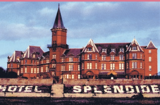
The Slieve Donard during filming of 'Hotel Splendide', 2000

The film 'Hotel Splendide', starring James Bond actor Daniel Craig, was filmed at the Slieve Donard. 'It had all the qualities we were looking for - a fairy tale element, a hint of gothic and was overwhelmingly big to dwarf the staff and guests,' said the film's producer, who had searched for a year for the right hotel.